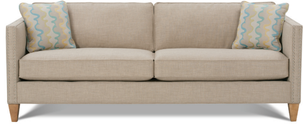
2 back over 2 seat cushion option

Shown in fabric 14999-64, toss pillow fabric 26379-34, pewter nailhead. Washed Pine wood finish.