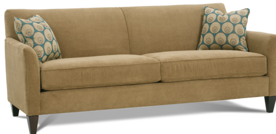
2 seat/back cushion option Shown in fabric 14599-21, toss pillow fabric 27279-67, tapered leg and espresso wood finish.