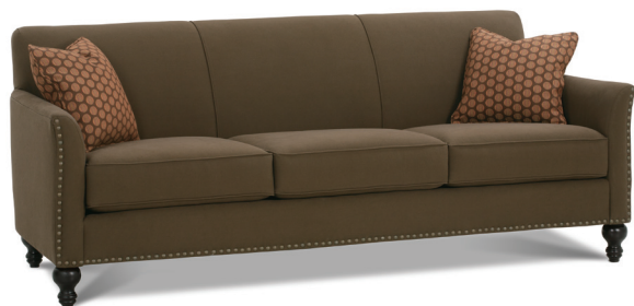
3 seat/back cushion option Shown in fabric 16919-80, toss pillow fabric 18560-80, brass nailhead, turned leg and espresso wood finish.